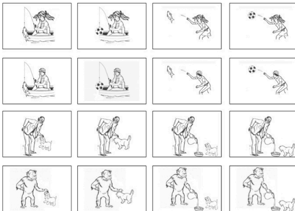
FIGURE 1 | Experimental material. The sixteen vignettes depicting simple scenarios (from Langus and Nespor, 2010).

Participants saw a sequence of 16 vignettes on a computer screen presented in random order. These vignettes were the same they saw during the Teaching Phase. Participants were told that after the appearance of each vignette (that could remain on the screen as long as they needed), they had to describe it to the experimenter making the corresponding gestures. They were also explicitly told that each time they should use three gestures in order to describe all components of the vignettes, but these components (i.e., categories of agent, act, and object) were named in a random order for each participant, in order to avoid any influence on the order they would choose. Moreover,